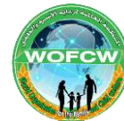
World Organization for the Family and Child Welfare, Sudan