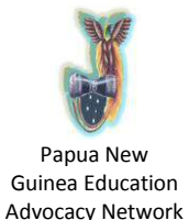
Papua New Guinea Education Advocacy Network