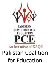
Pakistan Coalition for Education