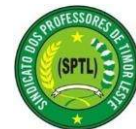
Teachers' Union, Timor Leste